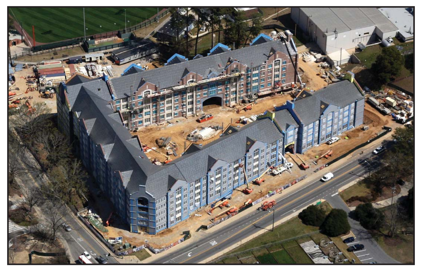
Aerial view from south elevation

Project Status: The project is 70 percent complete. The interior work on the project is on schedule, but the exterior masonry and stone work are approximately thirty days behind schedule. The entire project team is working to ensure the Residence Hall will be completed by late July. The project is within budget.