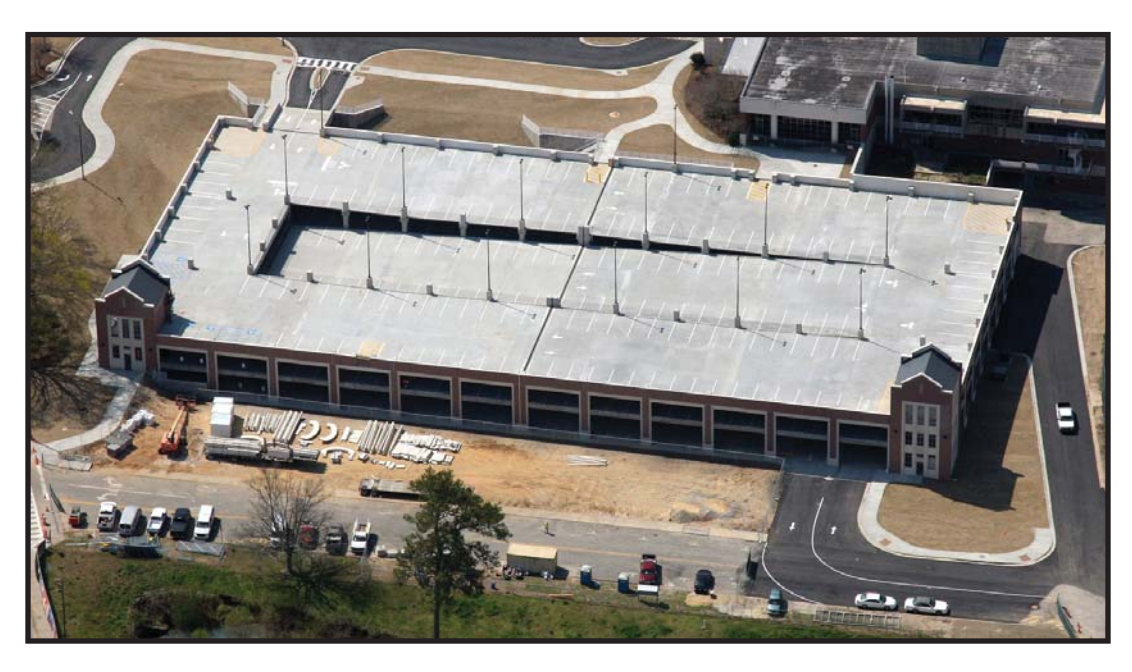
Back to top