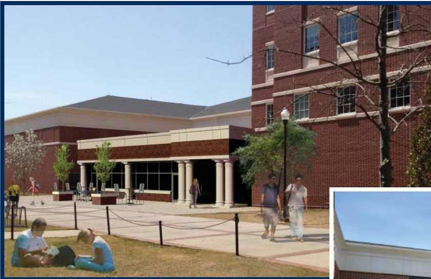
Rendering of Lowder Hall Student and Faculty Lounge

Project Status: The project is 35 percent complete and is within budget. Under slab rough-in work for mechanical, electrical, and plumbing is complete. The concrete slab is in place and structural steel installation has begun. Target construction completion is early July 2014 with Starbucks opening prior to the 2014 fall semester.