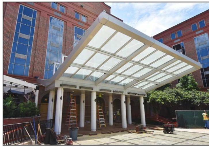
Glass and metal panel installation on the porte cochere is complete.

Project Update: The main entrance will open the first week of June.