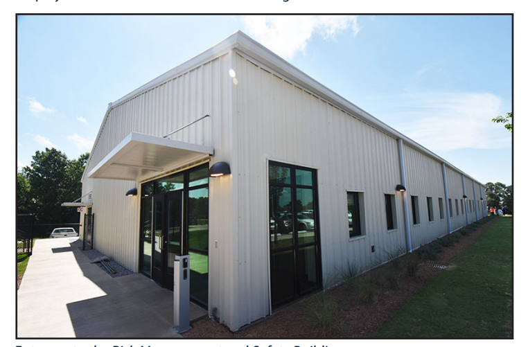
Entrance to the Risk Management and Safety Building.