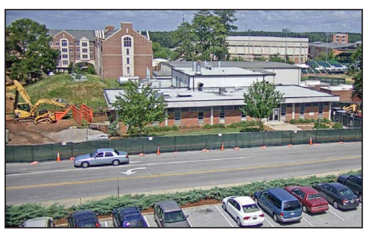
View from the Leach project webcam