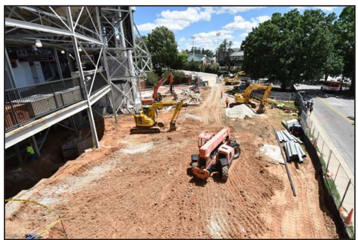
An alternate view of the parking lot demolition.