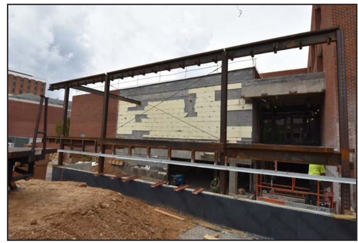
The original entrance has been removed, and structural steel is being erected.

Project Update: This project is 15 percent complete. All interior demolition is complete for Phase I and II. Concrete foundation and slab on grade work has been completed. Structural steel erection is underway and scheduled to be completed in early June. The existing auditorium roof has been replaced. Installation of interior metal studs is underway on the ground floor along with electrical and plumbing installation.