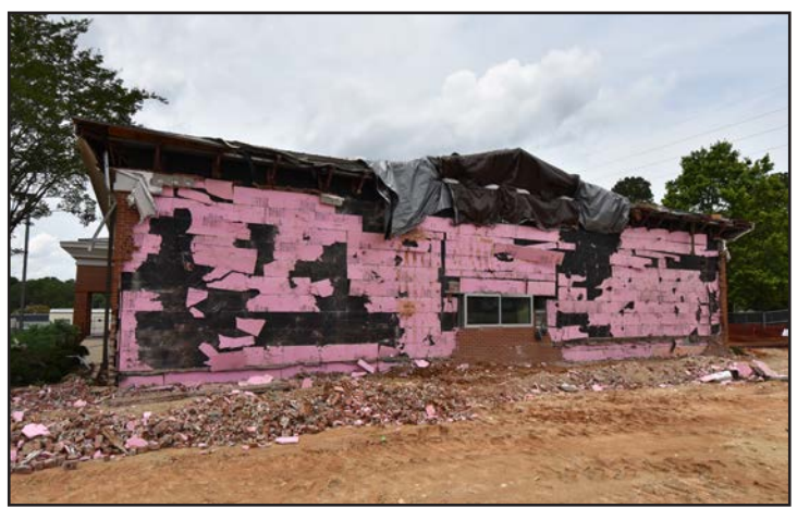
Demolition of the canopy is underway.