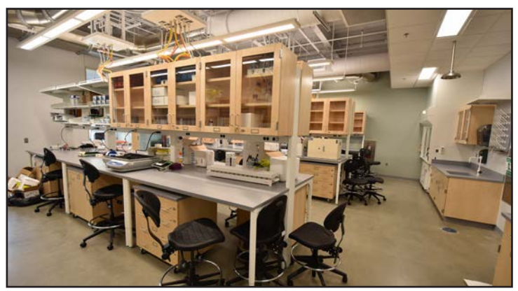
Research lab support spaces located in the facility.