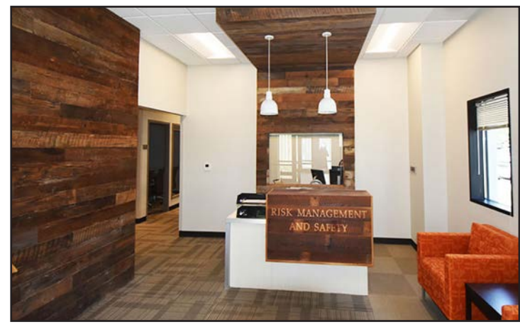
Lobby of the Risk Management and Safety Building.

Project Update: The project is now complete, and Risk Management and Safety employees have moved into the building.