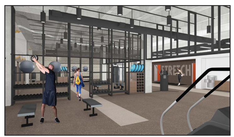
Rendering of the power lifting and weightlifting space.