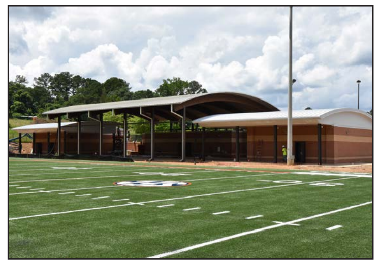
Exterior view of the men's and women's dressing rooms.