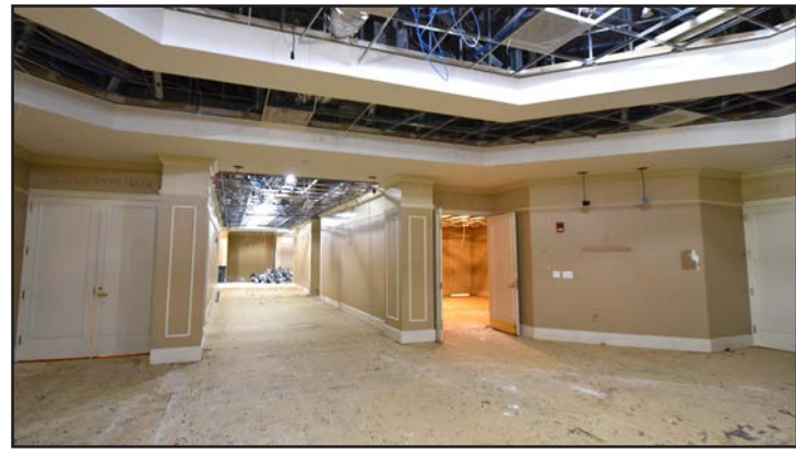
Conference Center demolition is underway.

Project Update: The project is 5 percent complete. The Conference Center shut down on May 15, 2017 for construction to begin. A temporary tent (marquee) has been installed in the Hotel parking lot to replace conference center space lost during the renovation. Inside the Conference Center, demolition of ceilings, carpet, tile flooring and walls is underway. Installation of metal studs for the new walls will start mid-June.