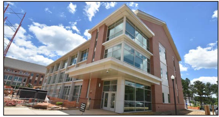
Front entrance to the new Pharmaceutical Research Building.

Project Update: The project was substantially completed on Friday, May 5, 2017. Harrison School of Pharmacy researchers began moving into the first and second floors on Monday, May 15, 2017. As planned, build-out of the third floor will be ongoing through mid-July. The third floor will include additional office space and research labs.