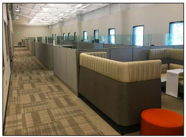
Employee work area within the new building.