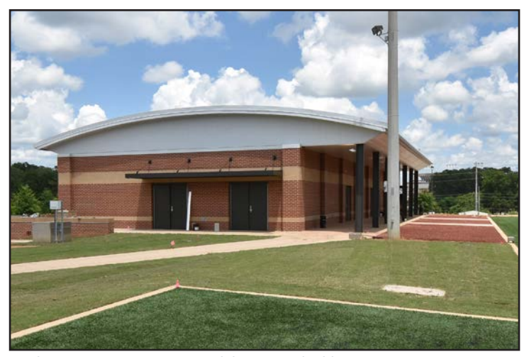
Landscaping is in progress around the storage building

Project Update: This project is 95 percent complete, and is scheduled to finish during the first week of June. The contractor is finishing the interior flooring, mirrors, shelving and benches. On the exterior, the contractor is finishing the metal panels on the dressing rooms. Landscaping is currently in progress.