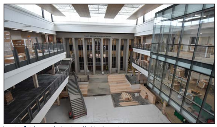
Interior finishes are being installed in the atrium.