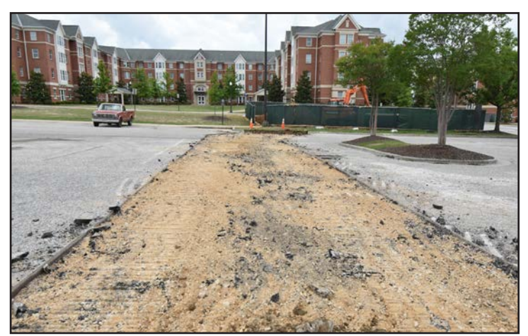
Utility work is in progress in the parking lot located south of Campus Safety.