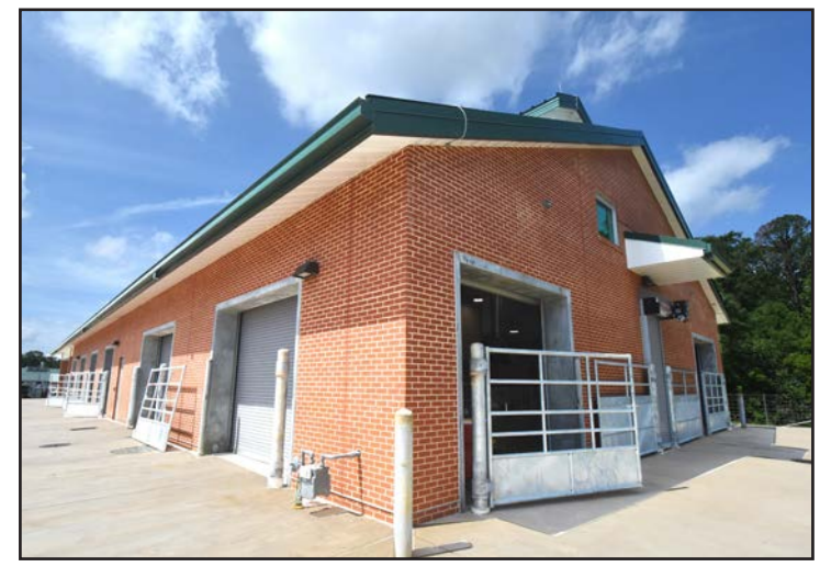
Exterior view of one of the livestock entrances to the facility.