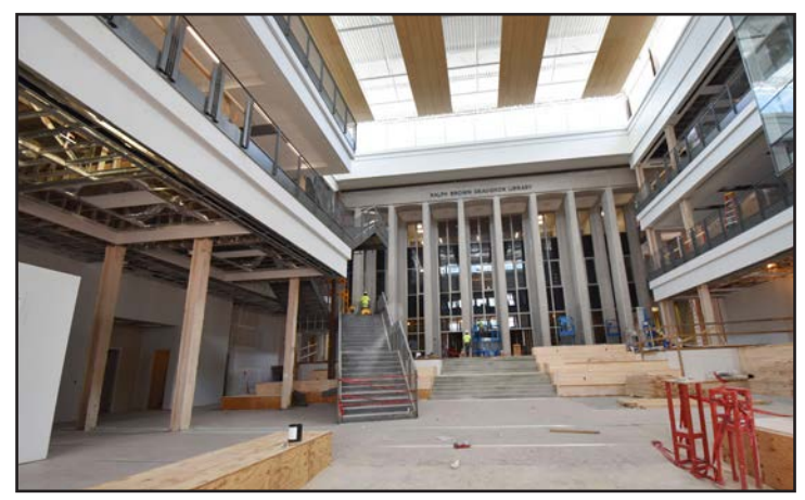
Hand rail installation is under way in the central atrium.