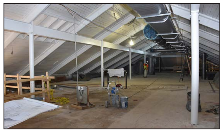
Third floor after demolition.