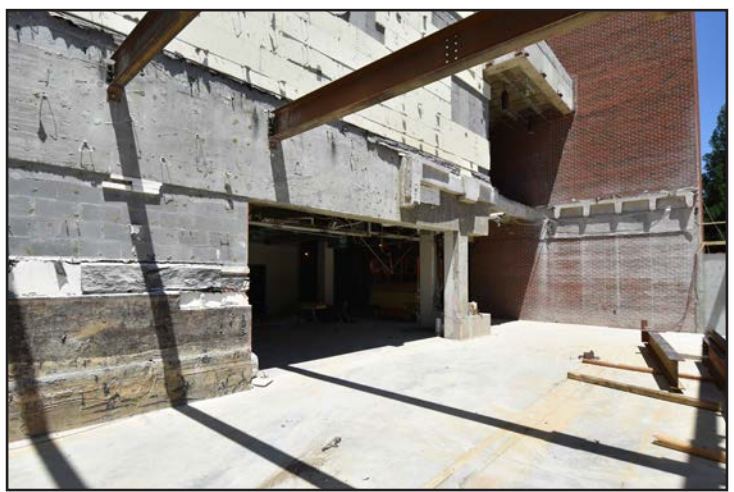
View of ground level exterior construction where a wall has been removed.