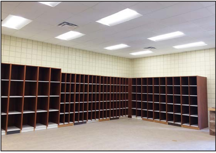
Instrument shelving inside the new storage building.