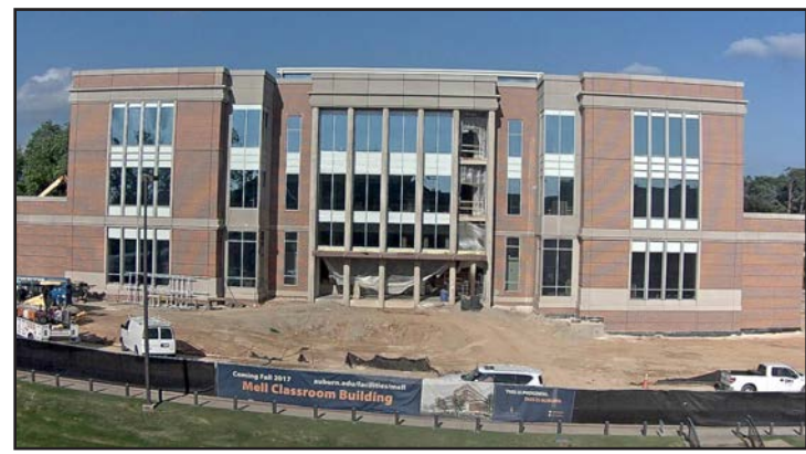
View of the Mell Classroom Building from the project webcam.

Project Update: The project is 85 percent complete. Brick masonry and window installation near completion on the exterior of the building. Interior finishes such as flooring, wall finishes and ceilings are being installed at all floor levels. Site work for steps, sidewalks and landscaping has begun. The building is on track to be operational for fall 2017 semester.