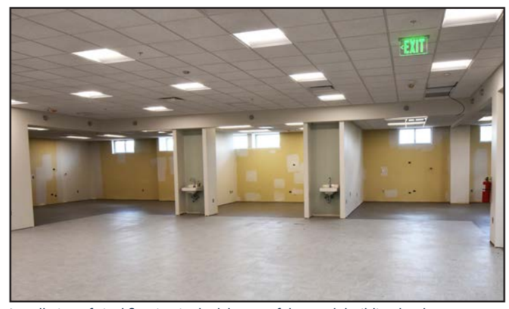
Installation of vinyl flooring in the lab area of the north building has begun.