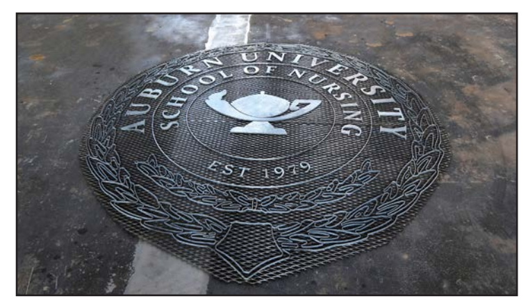
The School of Nursing seal will be located in the building's central entryway.