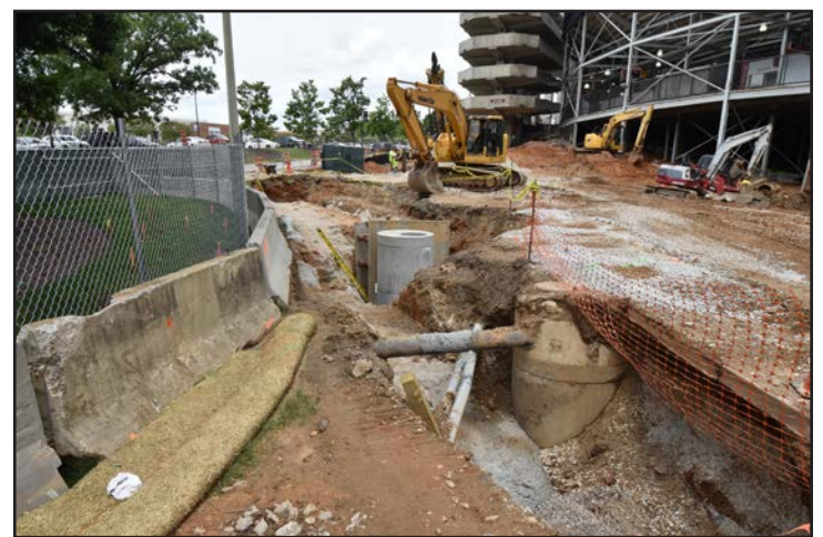
Underground utility work has started.