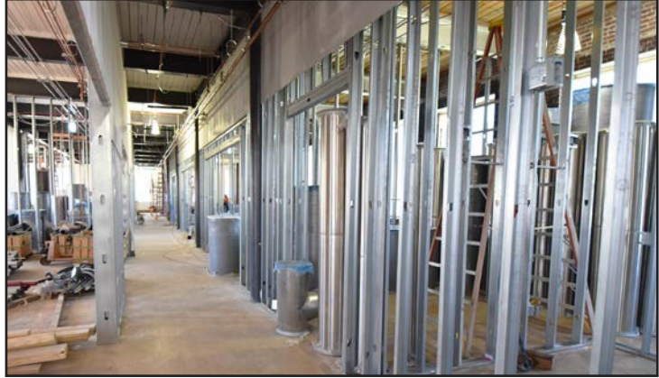
Framing is underway on the second floor.