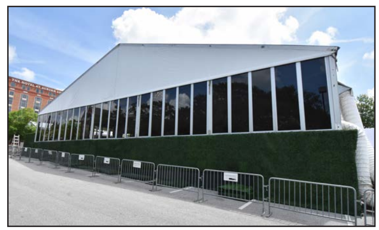
A temporary tent (marquee) has been built in the hotel's parking lot.