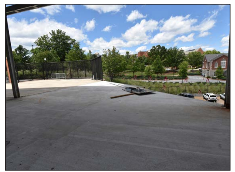
Custom metal railings are being created to accommodate the new concourse.