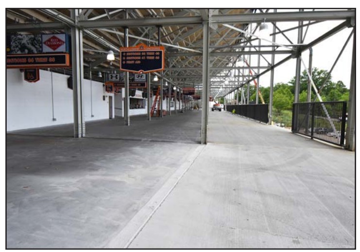
Looking west, the area to the right is the new concourse expansion.