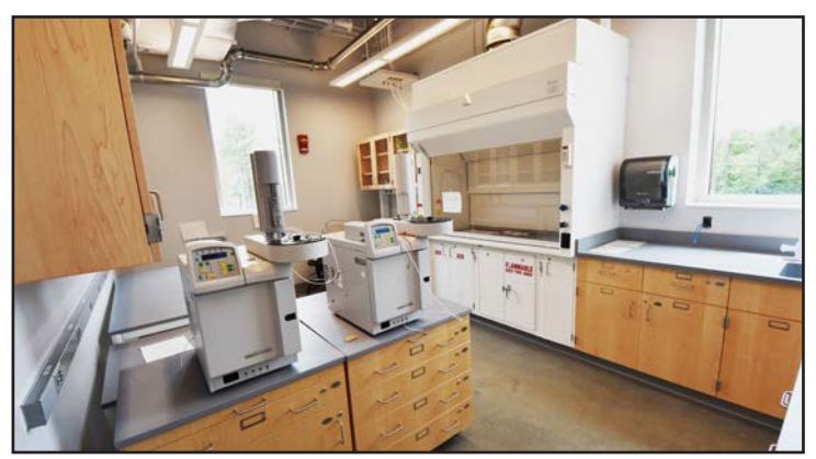
One of the building's research labs.