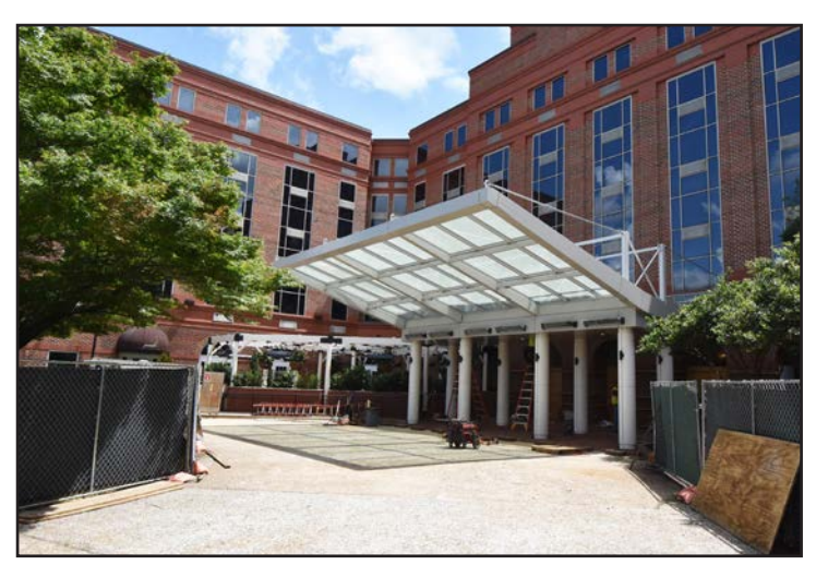
View of the porte cochere looking toward the northeast.