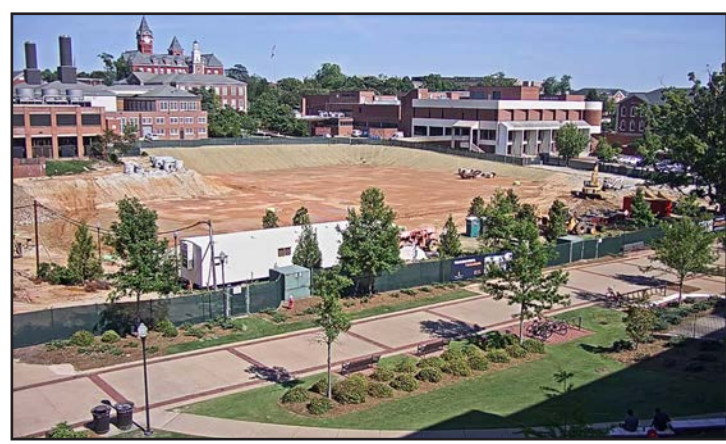
View of the demolition site from the Shelby Center webcam.

Project Update: The project is 85 percent complete. Demolition of the L Building and three Engineering Shops is complete. The university recycled 95 percent of the construction debris removed from the site (this number includes demolition materials removed from the Gavin Engineering Research Renovation project as well). Installation of the new sanitary sewer is 80 percent complete, and site grading for the future Brown-Kopel Engineering Student Achievement building pad is well underway.