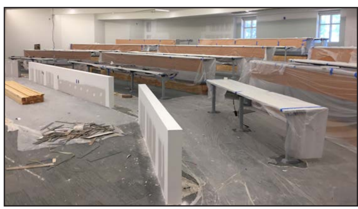
One of the tiered classrooms in the facility.