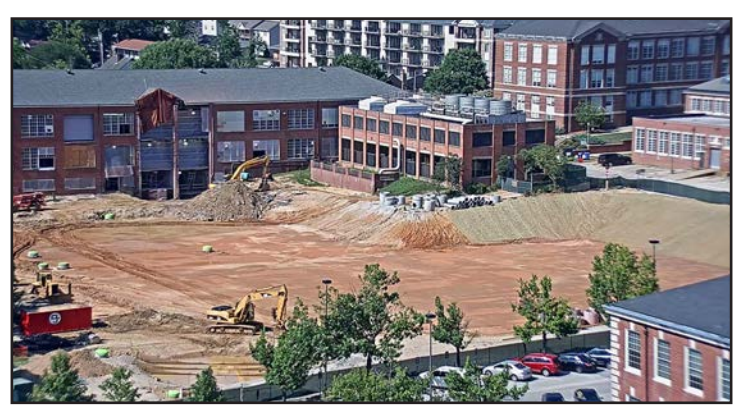
Grading for the Brown-Kopel Engineering Student Achievement Center is underway