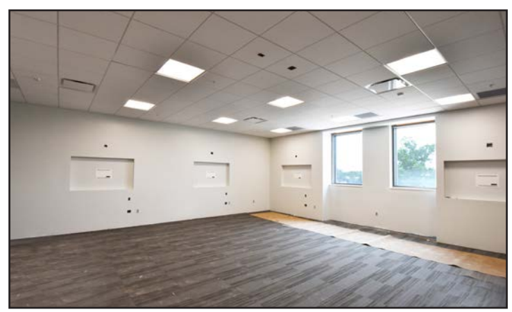
One of the 26 active learning classrooms, which will feature interactive screens.