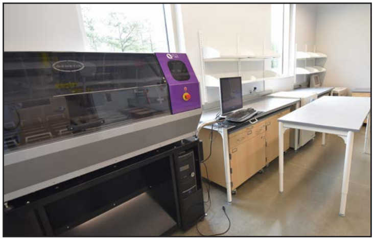
One of the building's research labs.