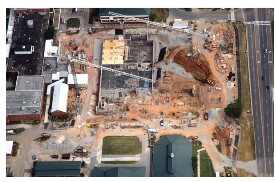
Aerial view looking east Back to top