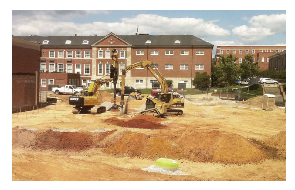
View looking north

Project Status: The project is currently 10 percent complete. The demolition of the existing shop addition to M.W. Smith Hall has been accomplished. The installation of the site utilities, footings, and foundation work is currently in progress and will be followed by underslab plumbing and electrical activities. The project is on schedule and within budget.