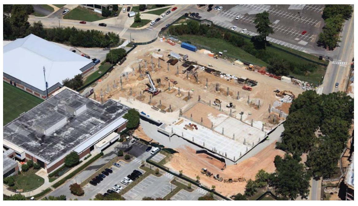
Aerial view looking northwest