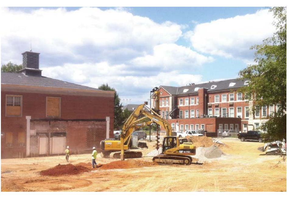
View looking northwest