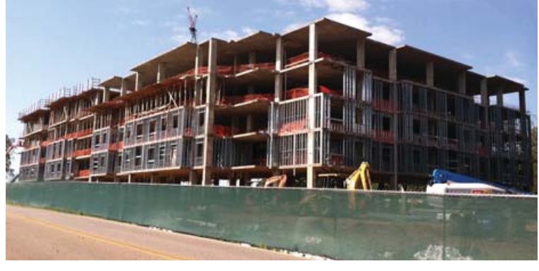
East elevation Northeast elevation