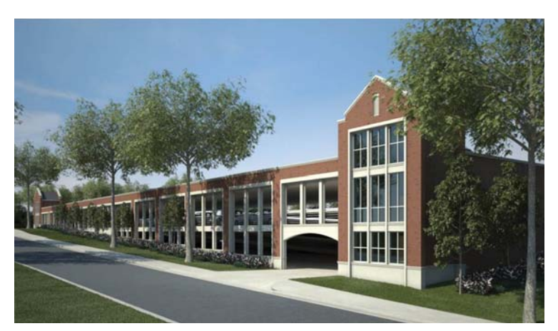
Architect rendering of the Biggio Drive Parking Facility