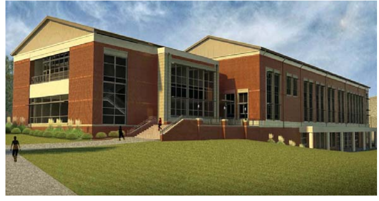
Architect rendering of the Kinesiology Building