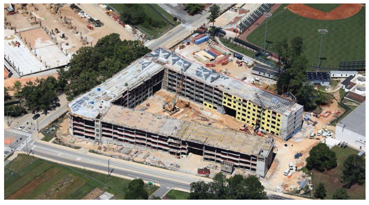
Aerial view looking north