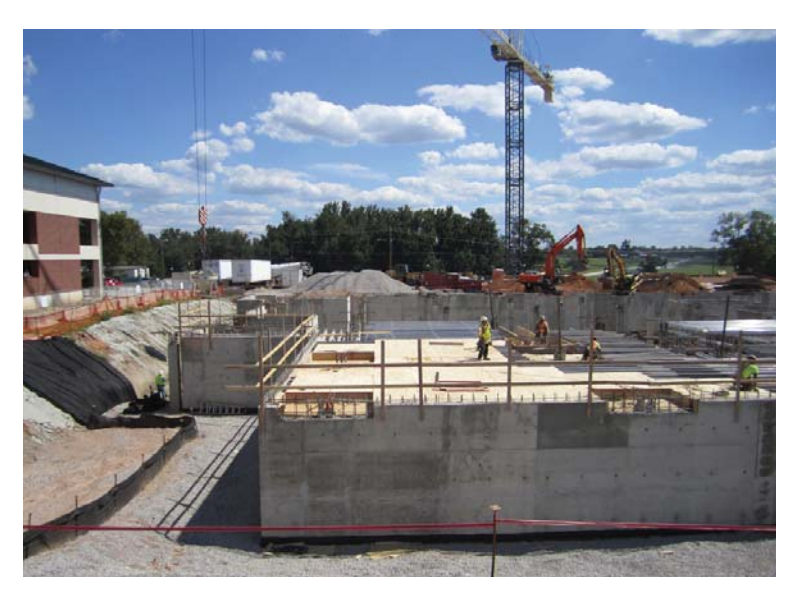
East elevation of first floor framework