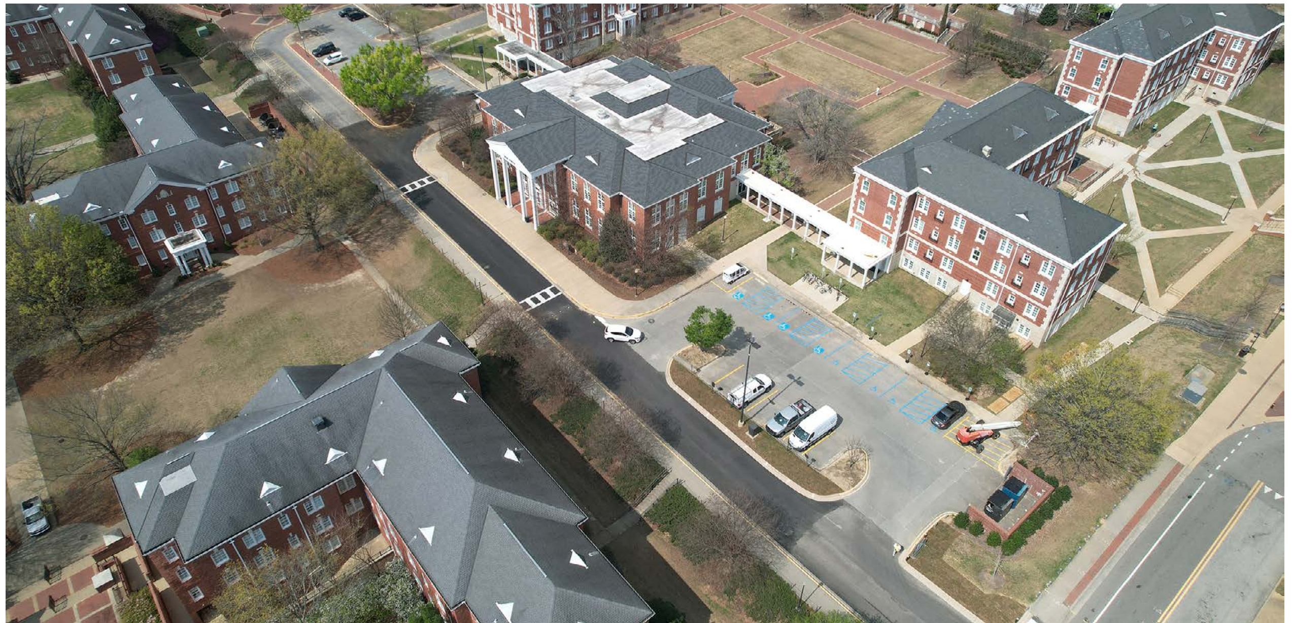
An aerial view of the completed Quad Drive Infrastructure Improvements project site. The darker asphalt highlights where the improvements took place.