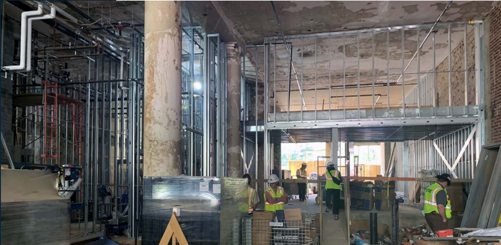
Metal wall framing is taking place near the CADC shop area of the Hood McPherson Building.

Clients: COLLEGE OF ARCHITECTURE, DESIGN AND CONSTRUCTION and HARBERT COLLEGE OF BUSINESS