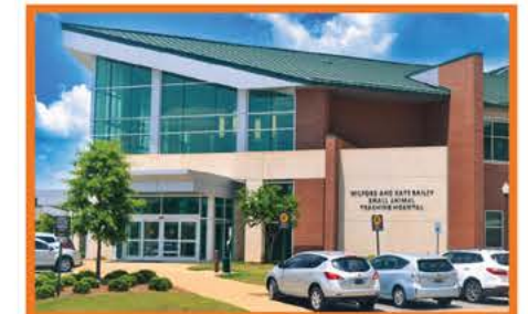
Bailey Small Animal Teaching Hospital