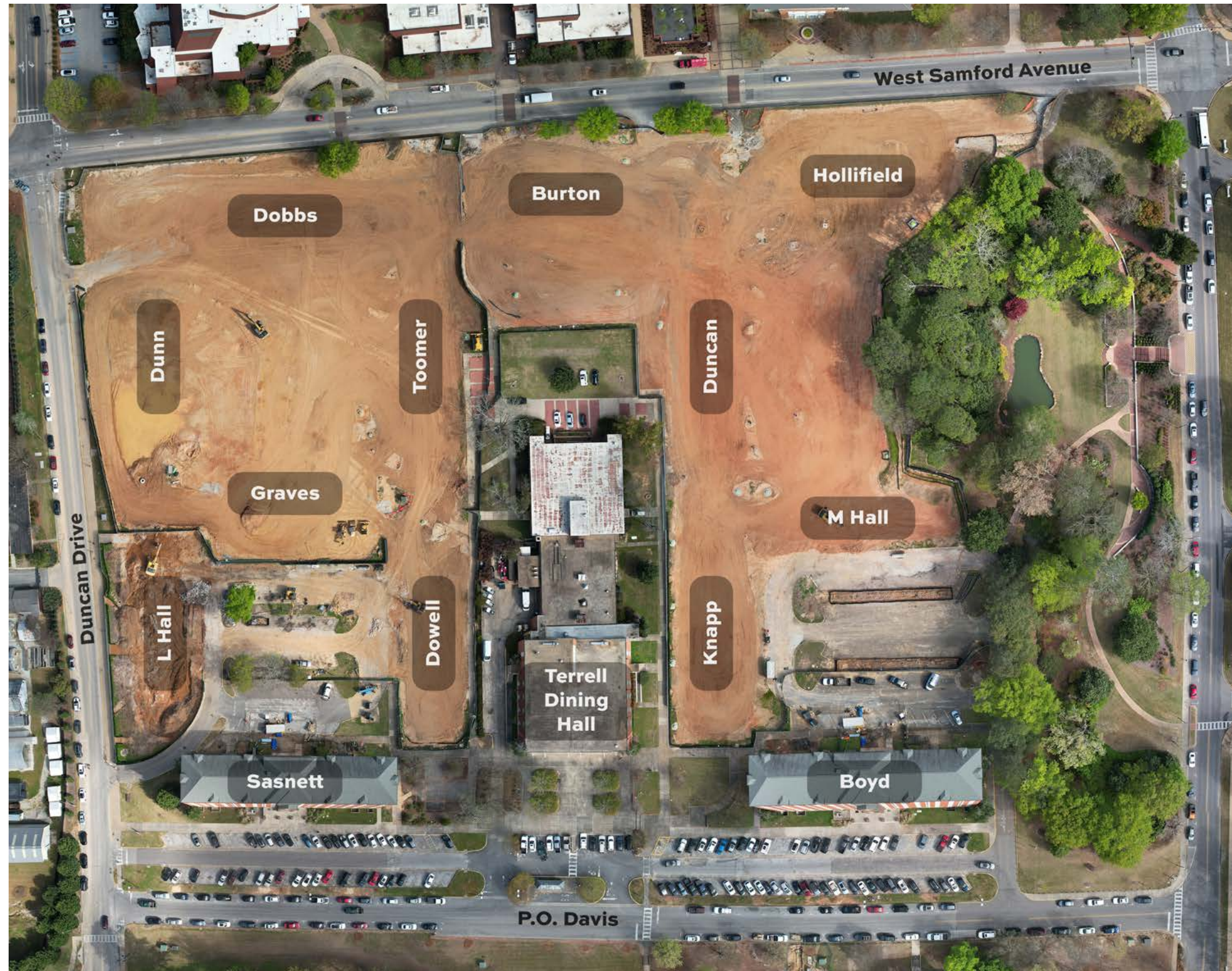
An overhead view of the former Hill Residence Halls location. The top left area will be the location of the College of Education building. The Science, Technology, Engineering and Mathematics (STEM) and Agricultural Sciences Complex will be located to the right.

The Hill Residence Halls complex was comprised of 14 buildings totaling more than 1,400 beds. A majority of the buildings were built between 1962 and 1967. Given the age of the Hill Residence Halls complex, the university has determined that investing in a major renovation of the residence hall buildings will not be cost effective. The Campus Master Plan has recommended that, once the Hill Residence Halls are demolished, the site house future academic buildings.