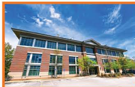
Auburn Research Technology Foundation Building