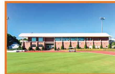
Soccer and Track Facility