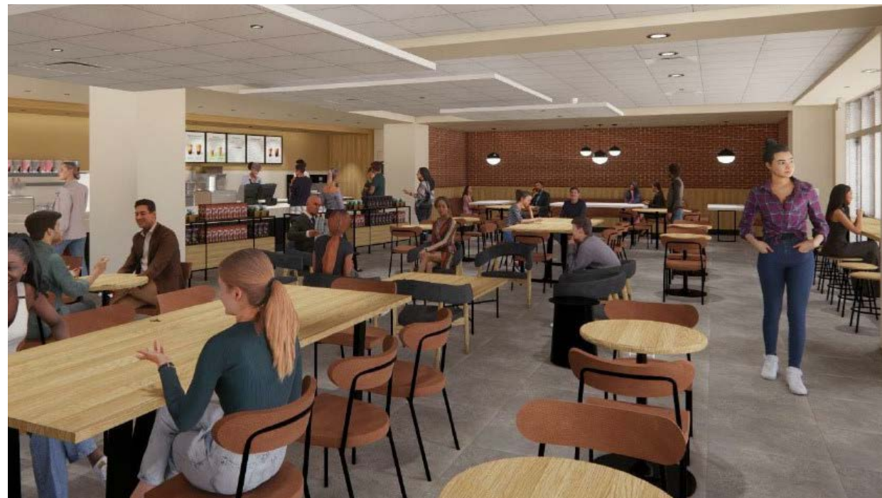
The new location will include a dining area of more than 55 seats.