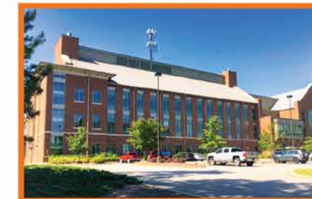
Center for Advanced Science, Innovation and Commerce (CASIC)