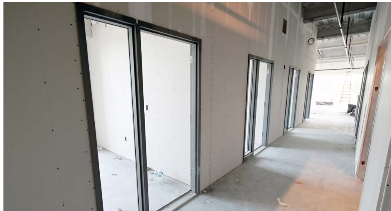
Wall framing for the administrative offices is complete.