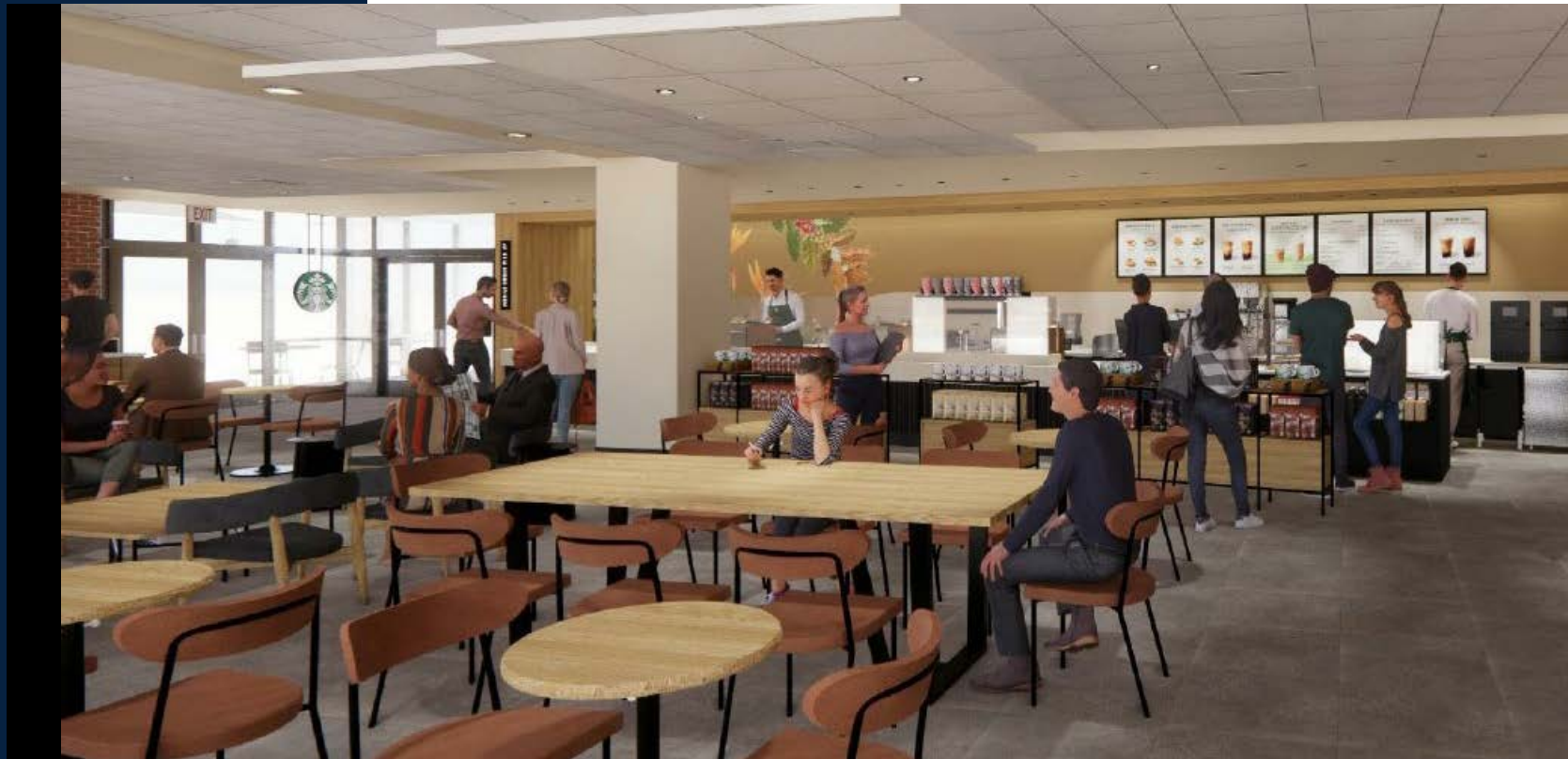
An artist's rendering illustrating the expanded Starbucks location in the Melton Student Center.