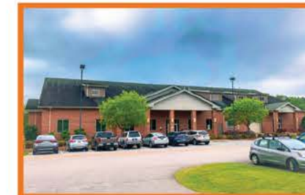
Aquatic Resource Center Administration Building