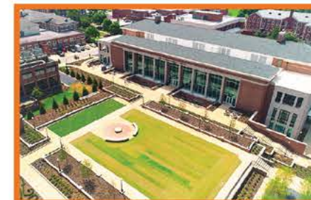
Brown-Kopel Engineering Student Achievement Center