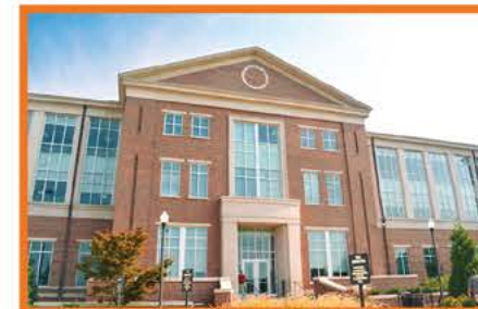
Information Technology Building