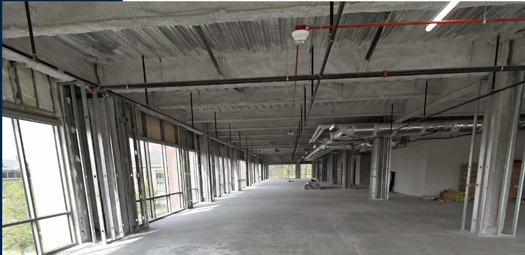
The fourth floor of the Research and Innovation Center will soon house the CADC Research Support and Innovation Center.

Client: COLLEGE OF ARCHITECTURE, DESIGN AND CONSTRUCTION