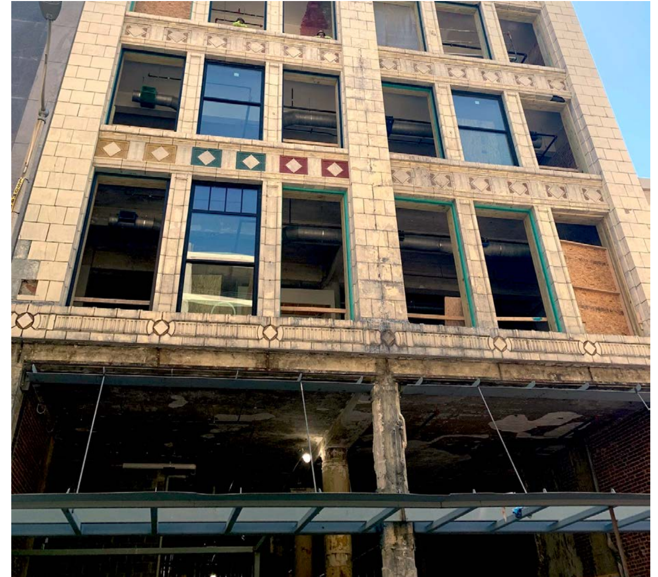
Installation of the north-facing entry canopy has begun.