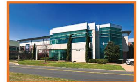
Veterinary Education Center