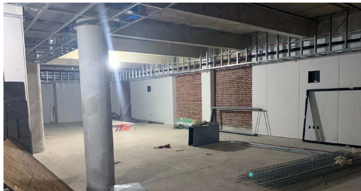
Drywall installation has begun in this fourth-floor meeting room.

Architect: WILLIAMS BLACKSTOCK ARCHITECTS Contractor: STONE BUILDING, LLC