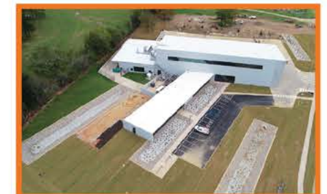
Advanced Structural Engineering Laboratory