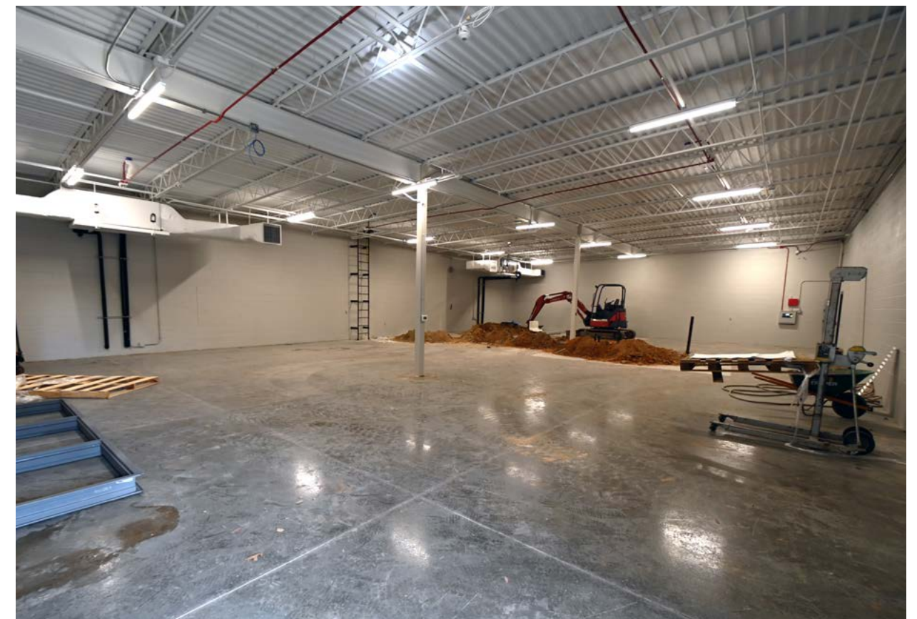
Slab trenching has begun for utilities within the shop building.

The CADC Research Shop portion of the project will renovate approximately 4,000 square feet of the adjacent Research and Innovation Center supporting building to convert it from a storage building to a fabrication and research shop. Research operations intended for the CADC Research Shop includes the CADC Mass Timber Research Initiative and the CADC Coastal and Riverine Resilience Initiative.