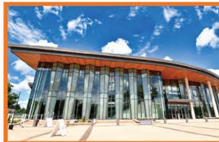
Jay and Susie Gogue Performing Arts Center